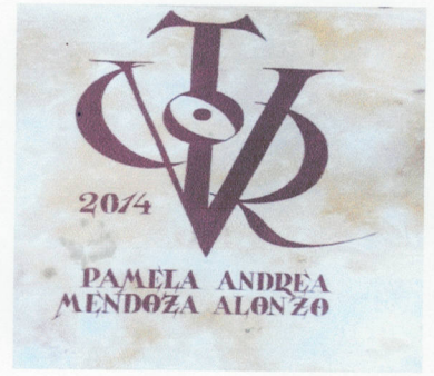
MODELO - C