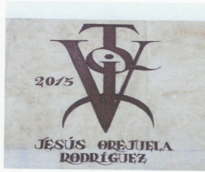
MODELO - B