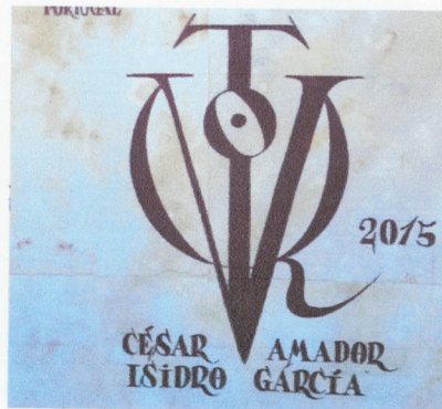
MODELO - E