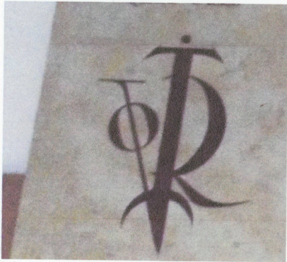
MODELO - D