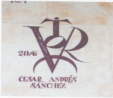
MODELO - A